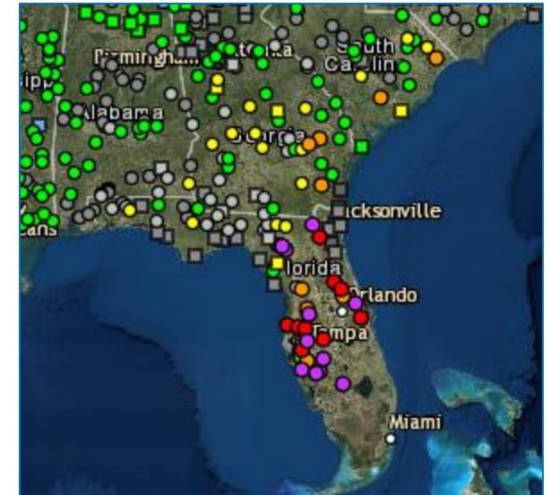
Significant River Flooding